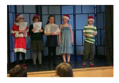
Family Learning Project Christmas Pageant

children in learning together in a fun way. It also shows parents what is included in the school curriculum and demystifies homework tasks, enabling parents to help their children with their school homework. Although it takes time to build up a relationship of trust with the parents, it is well worth the investment. Parental engagement with their children's education has proven to improve educational attainment and achievement, improves school attendance and raises aspirations. These are essential building blocks to enable a child to make their way in life, especially if they are from a disadvantaged background. To keep this valuable project going, we are urgently seeking your help.