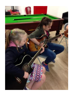
Music Therapy at Dove House

The Youth First program continues to help young people remain resilient against the myriad of social challenges arising from living in an area of deprivation.