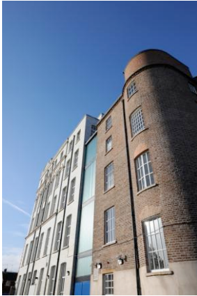
Newly refurbished entrance to Conway Mill.