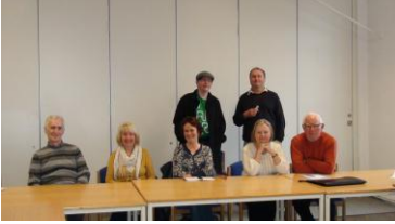
History of Belfast Class

Our holistic classes which promote healthy lifestyles and encourage people to look after the well being of themselves and their families, remain as popular as ever with an increasing number of students each year.